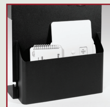
Store your VIP Complete Kit in compartment on back.