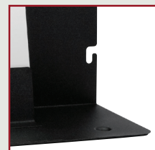
Notch in illuminated cabinet easily holds end of measuring cord.