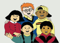
Vision In Preschoolers (VIP) Study Group